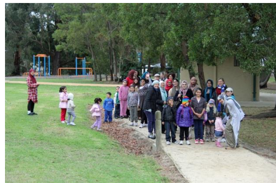
Waiting eagerly at the starting line!

Entry to the walk was by donation. All proceeds have gone to the Syrian Emergency Appeal, Muslim Aid Australia. A big thank you for the generosity of all participants who raised $365 on the day!