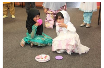
Sweeping out their parents' shop. Nibbling cakes at a picnic.