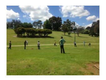
Eid-ul-Adha picnic lunch

Alhamdulillah, UMSLV has got off to a great start!