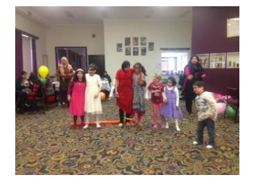
Eid-ul-Fitr Eid festival